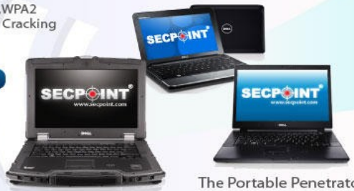
The Portable Penetrator

Click to buy a Portable Penetrator at our Web Shop